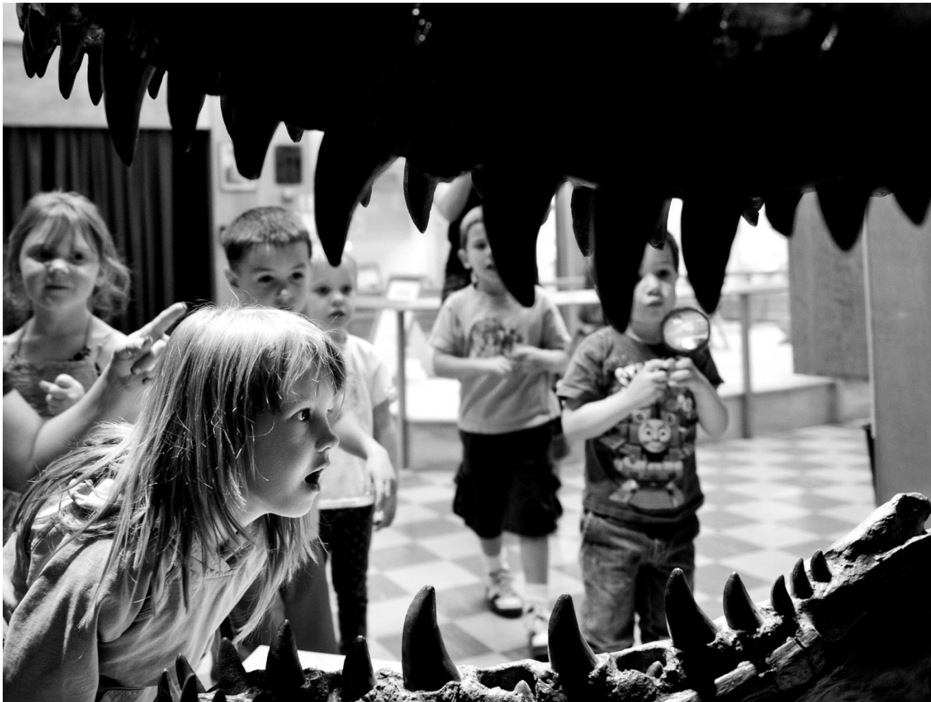
A preschool class from the University of Wyoming Early Care and Education Center examine a T-Rex skull in the university's Geology Museum. This was part of a series of assignments from the university's marketing department highlighting the work of the Early Care and Education Center.